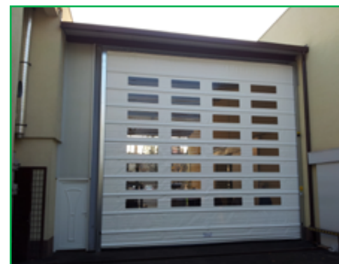
INTERNAL MOTOR VERSION - HIGH VISIBILITY