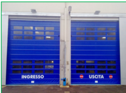
CUSTOMIZED CURTAIN - HIGH VISIBILITY