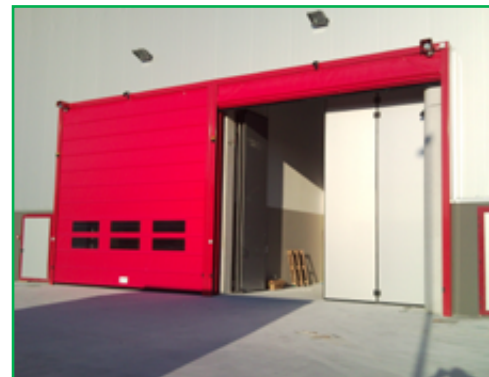
PAINTED FRAME "RAL" - RADAR