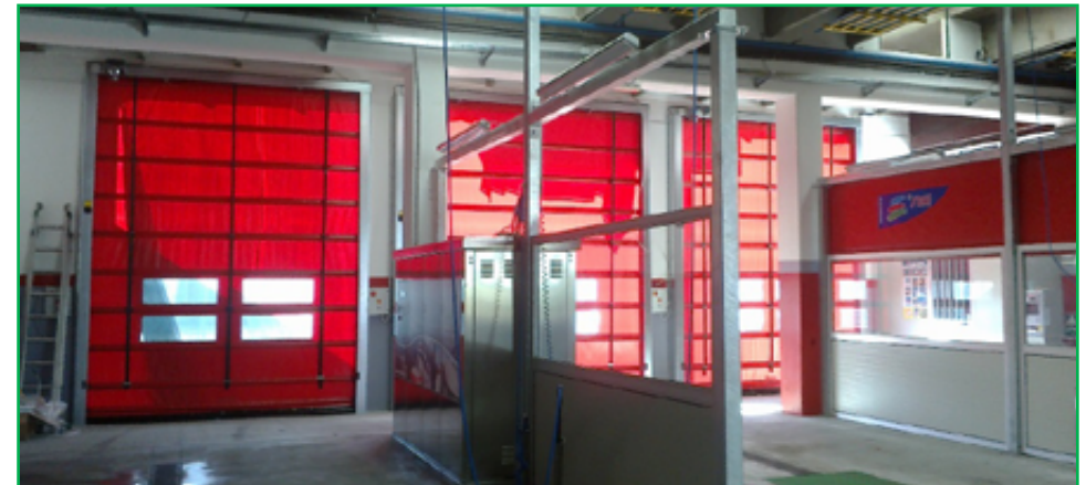
VELO PACK - INTERNAL VIEW

On request stainless steel INOX AISI 304/316 version or RAL painted.