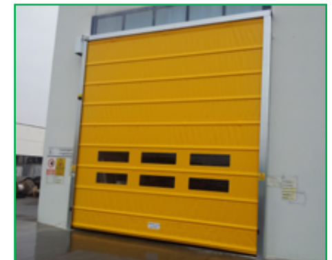
VELO PACK - STANDARD